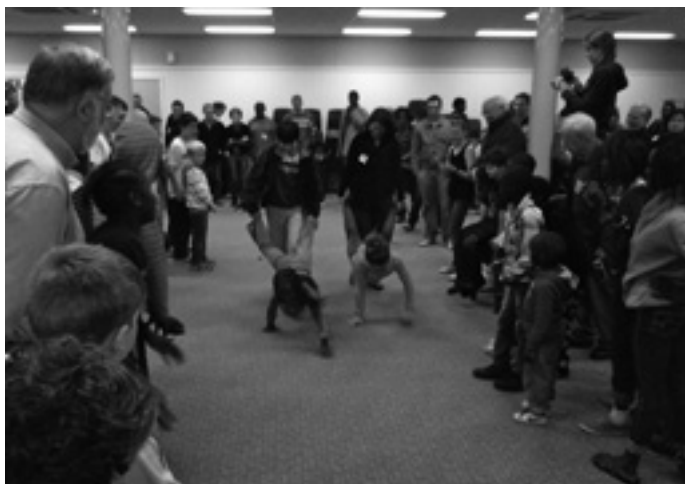
Younger campers proved their strength on family games night!

After a delicious lunch, in a packed dining room, afternoon activities included familiar challenges such as the High and Low Ropes Courses, the Flying Fox, Bushwalks, Trampolines and Archery as well as two new events, a Football Clinic, and a Café on the Verandah. The fine weather provided the perfect