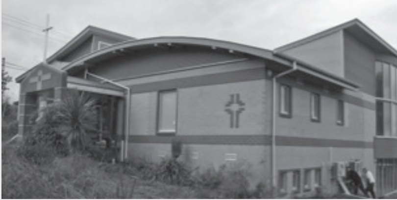
New and improved: the Heidelberg Presbyterian Church rebuilt after the fire

The old saying is: 'no news is good news'. With that thought in mind, you can usually sleep well at night. That is, until a phone call comes in the early hours of the morning, just when you don't expect it, for you are fast asleep.